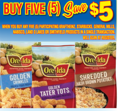
ALL VARIETIES ORE-IDA FRENCH FRIES, HASH BROWNS OR TOTS, 19 - 32 OZ.