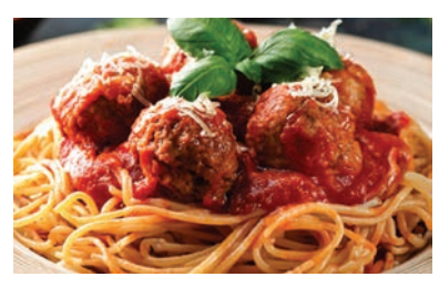
HOLIDAY MARKET'S PASTA WITH MEATBALLS & MARINARA $5.99/LB