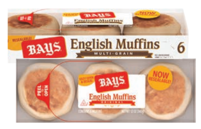
ALL VARIETIES BAY'S ENGLISH MUFFINS, 6 CT. 2/$7