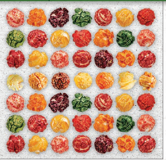
Holiday Market's Popcorn Made In Store Over 50 Flavors To Choose From