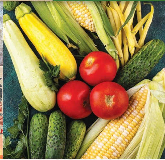
Constantino Farms Locally Grown Canton Produce