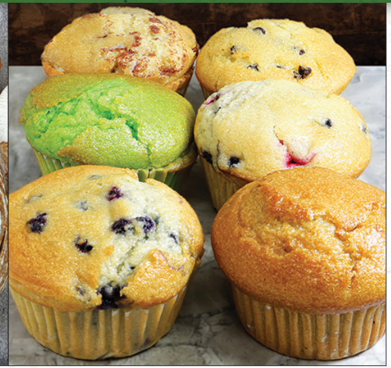
Fresh Baked Homemade Muffins Chocolate Chip, Blueberry, Banana Nut, Triple Berry & More