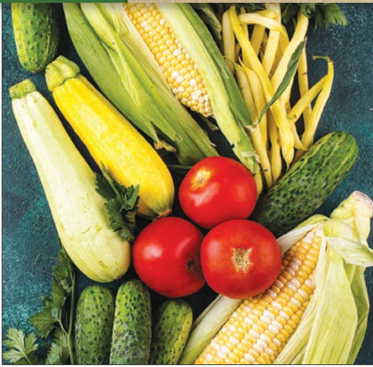
Locally Grown Canton Produce Multiple Items