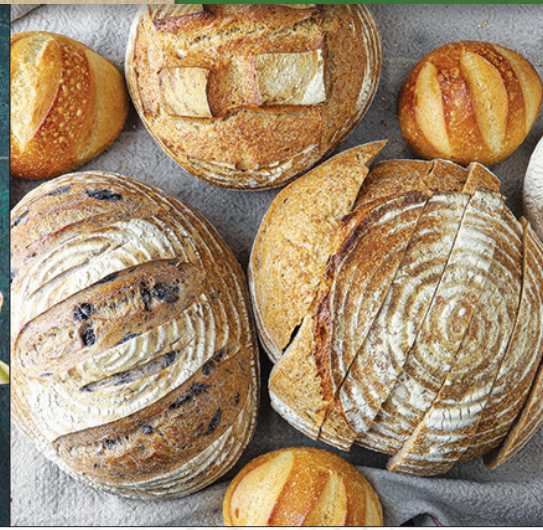
Scratch Made Breads Only 3 Ingredients No Preservatives